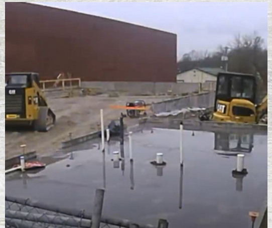
Concrete Footings, Utility Supply, and Cement Floor